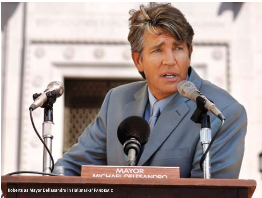
Roberts as Mayor Dellasandro in Hallmarks' PANDEMIC